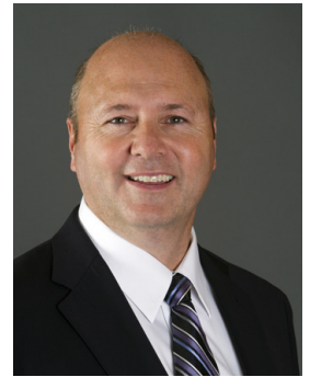
Jeff Gahan, Mayor City of New Albany